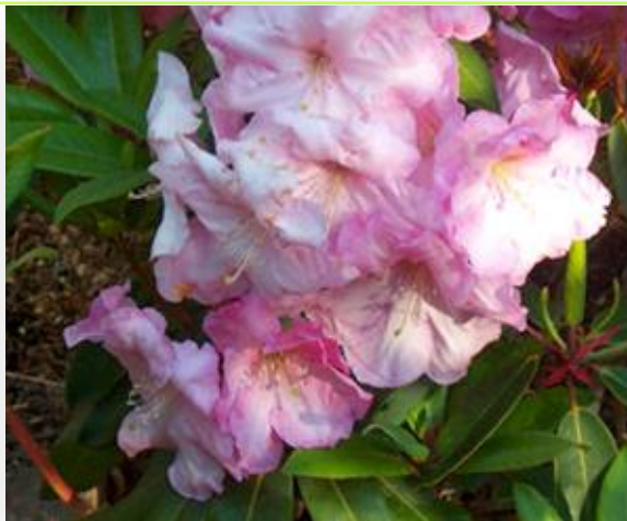
Loderi Pretty Polly