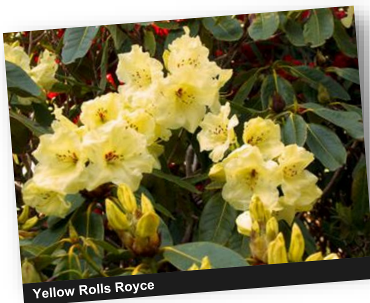
Yellow Rolls Royce