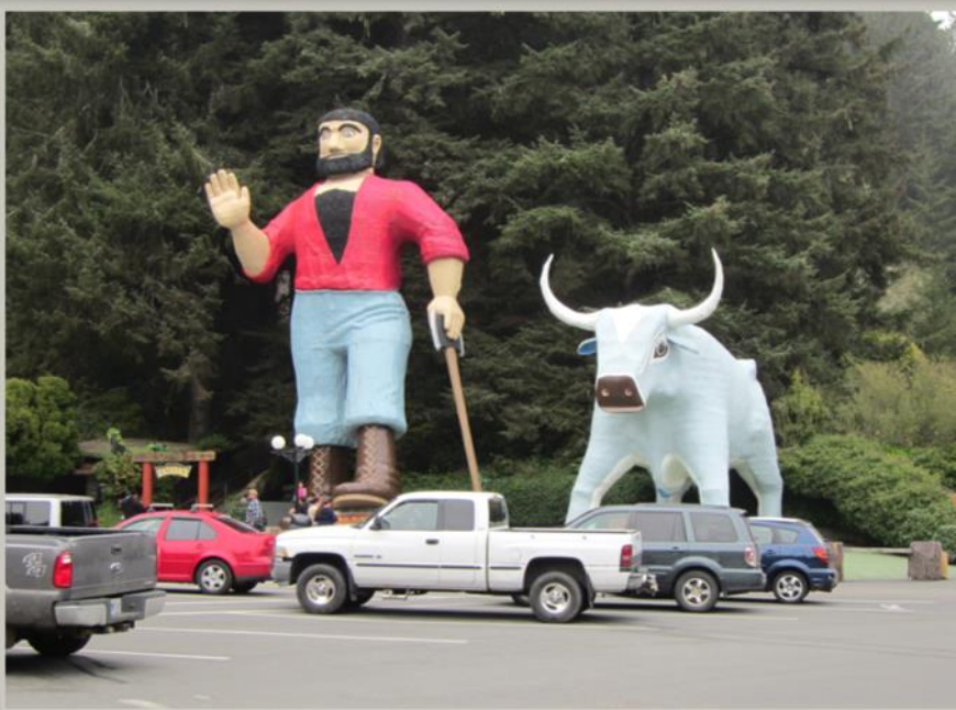
One of the many sights on the upcoming California Road Trip in Redwood National Park.