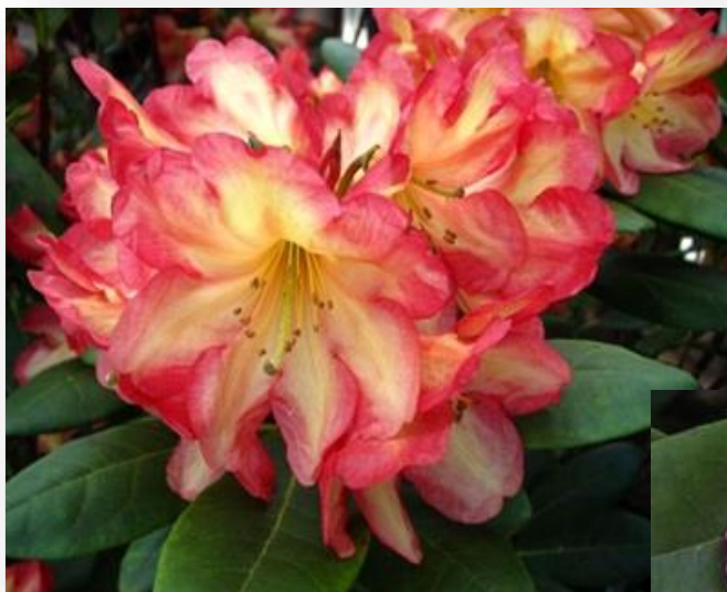
Ring of Fire