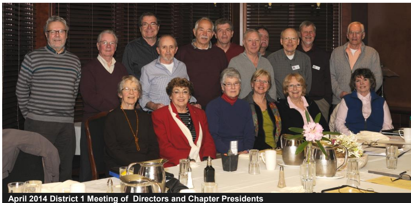
April 2014 District 1 Meeting of Directors and Chapter Presidents